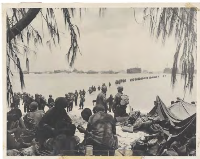
Reinforcements waded from their LSTs (Landing Ships, Tank) across a reef to a Saipan beach in June 1944.