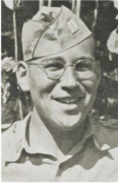
Captain Ben Salomon had worked as a dentist before registering for the draft in October 1940 and entering the U.S. Army as a private.