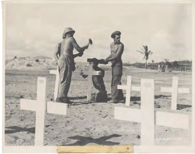
A Graves Registration Service team pounds newly painted crosses into the ground at a 27th Division graveyard on Saipan.